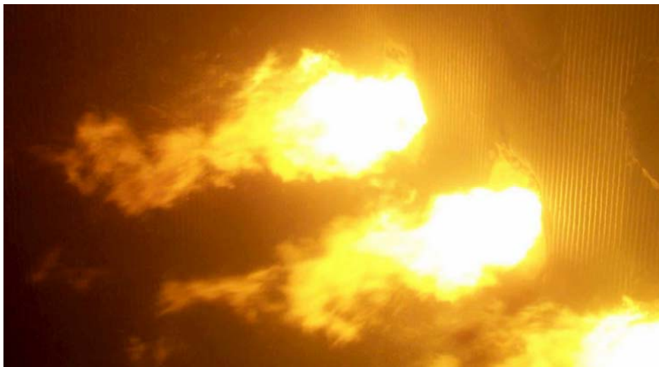
Light Up Burner Flames